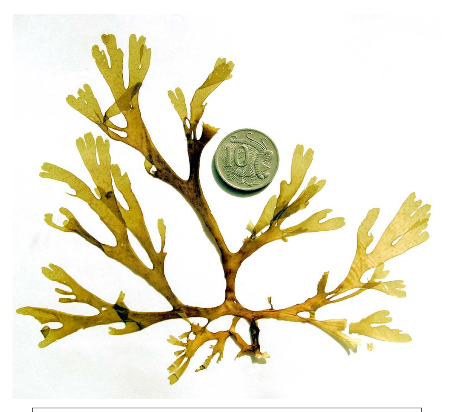
a drift plant of Dictyota diemensis Kützing, (A51859) from Pondalowie Bay, Yorke Peninsula, S Australia.