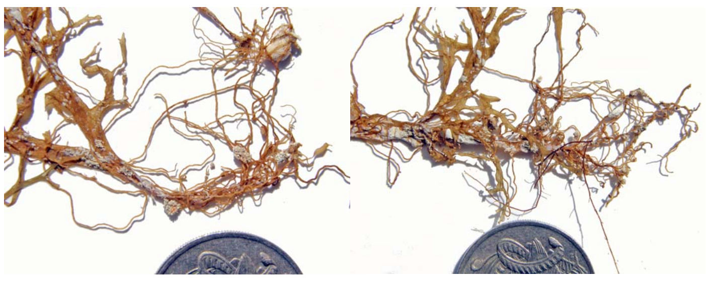
^{\ast} Descriptive names are inventions to aid identification, and are not commonly used "Algae Revealed" R N Baldock, S Australian State Herbarium, March 2003; additions July 2007